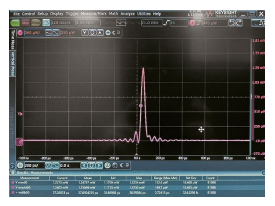
35\,\mathrm{ps} pulse at wavelength of 1310\,\mathrm{nm}